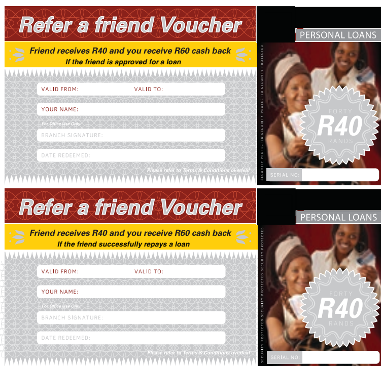
FIGURE 2. REFERRAL CARDS

could earn R100 (US$12) 13 for referring someone who was subsequently approved for and/or repaid a loan, depending on the referrer's incentive contract.